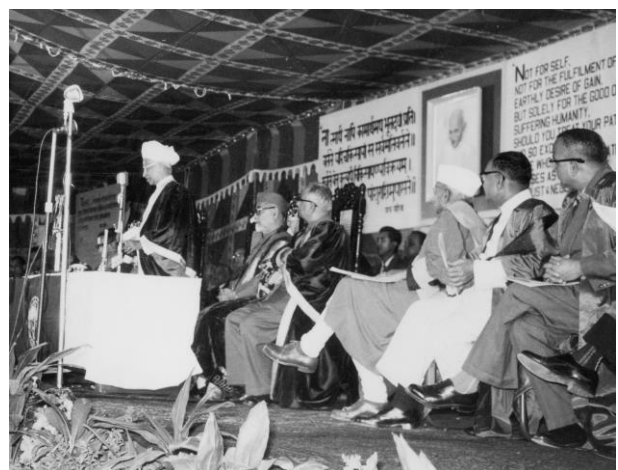
1 st Convocation, 1963